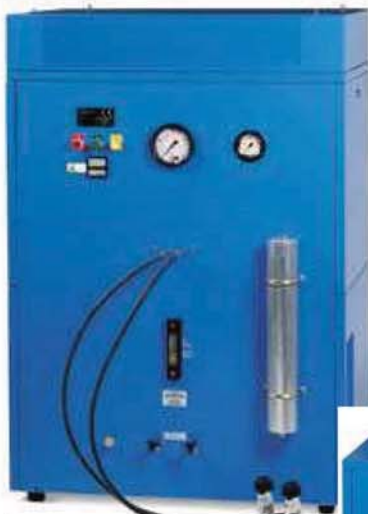
CHP13-16 SUPER SILENT

HIGH PERFORMANCES AND SAFETY FOR A SYSTEM ABLE TO REFILL WITH BREATHABLE AIR THE CYLINDERS AND THE BREATHING APPARATUS